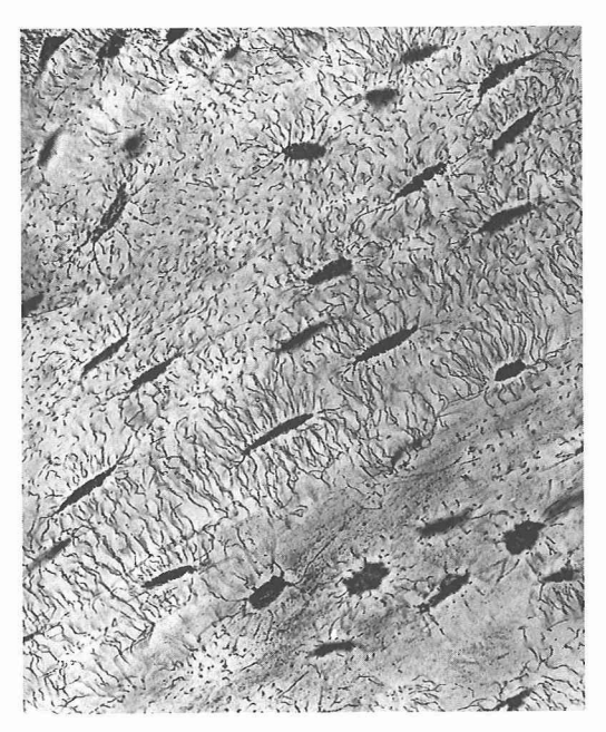
Figure 3: Bone canaliculi in the bone matrix are clearly observed in the Schmorl's thioneine-picric acid stained section (×300).